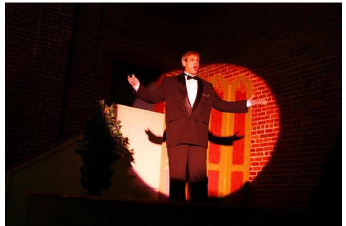
"120 th Anniversary Celebration"

with a festive celebration featuring four of our finest artists at the historical Telfer Hall in downtown Martinez.