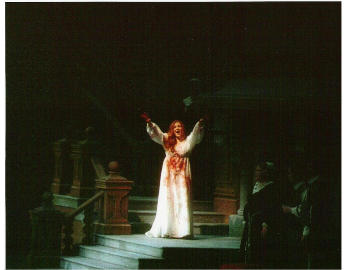
“Lucia di Lammermoor”

This year we are hard at work on our next fully staged opera, “Lucia di Lammermoor”, a dramma tragico (tragic opera) in three acts by Gaetano Donizetti. “Lucia” will be performed in October of 2010 at the Alhambra Performing Arts Center in Martinez.