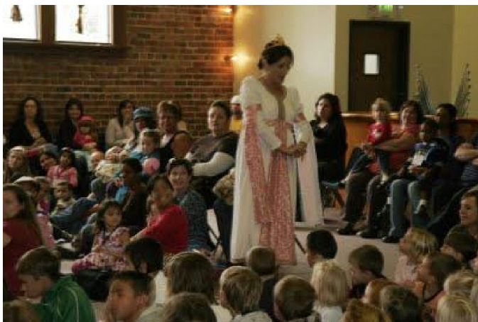
Culture for Kids 2009 “Papagenos Search for Love”

In October we presented “Papagenos Search for Love”, MTZO’s outreach program for young children under the age of five. Children enrolled in low-income and Head Start daycare centers in Contra Costa County had their first experience of opera, encountering Prince Orlofsky, Papagenno and Princess Pamina from Mozart’s Magic Flute , Cinderella, and other characters from classical operas. MTZO’s commitment to underprivileged children provides these young people with a rare introduction to classical music and art, part of our goal of bringing opera to everyone.