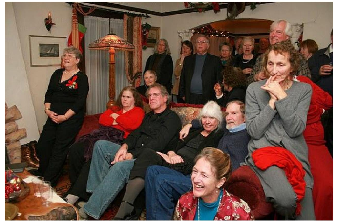
"Dine with a Diva"